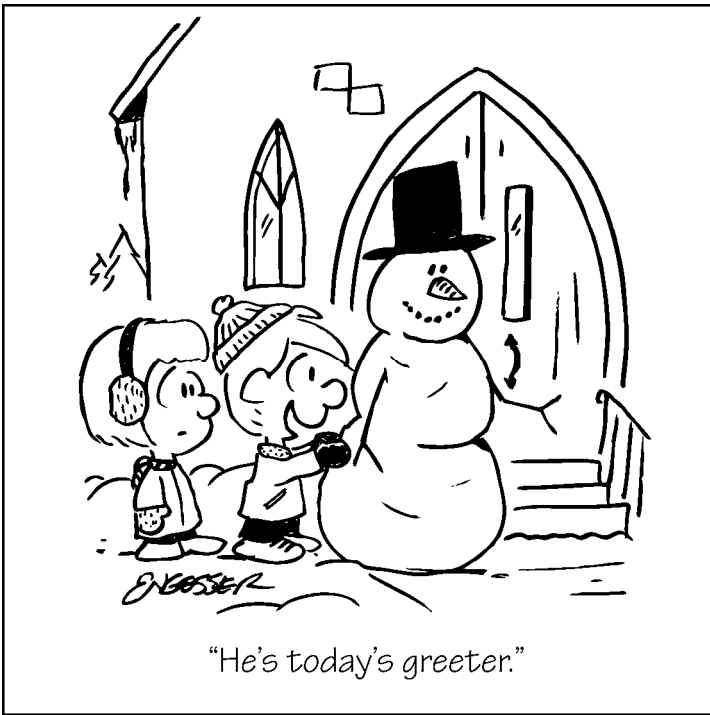
"He's today's greeter."